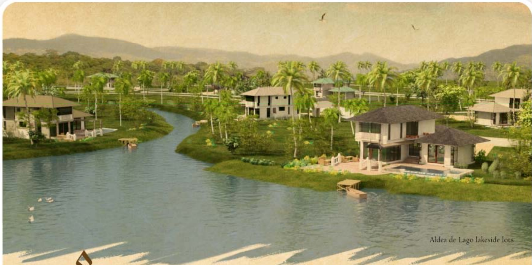
Aldea de Lago lakeside lots